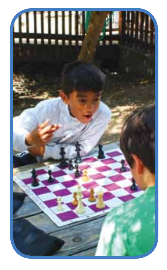
"The JCC is cool. We do cool things, and we go to cool places."