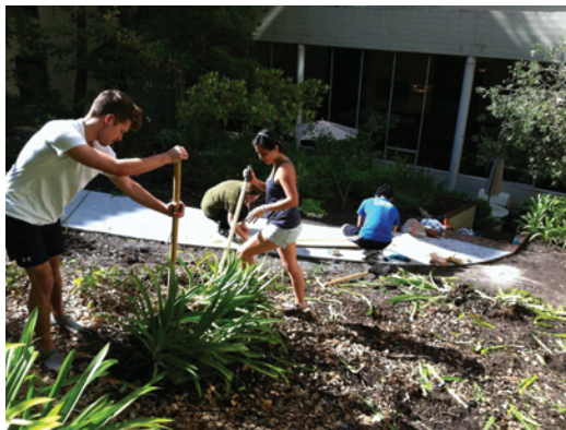
Residents break ground for the new garden in the space where the giant oak tree fell

When an eight-stories tall oak tree behind I-House fell last year following a rain storm, the resulting clearing behind the Dining Hall provided ample space for a new resident-driven initiative to create a sustainable garden.