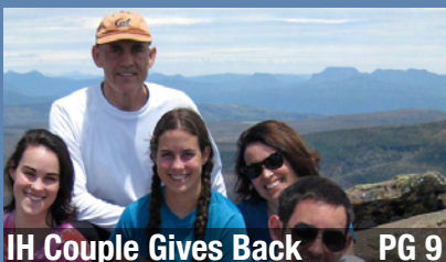
IH Couple Gives Back PG 9