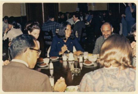
Joan Baez dining at I-House in 1967