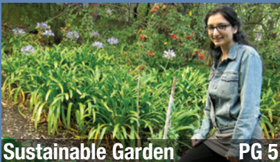
Sustainable Garden PG 5