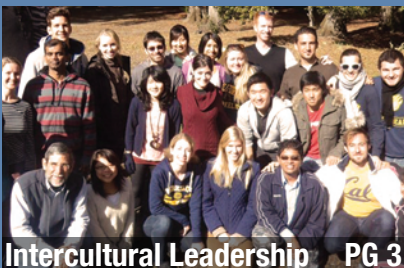
Intercultural Leadership PG 3