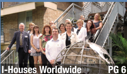
I-Houses Worldwide PG 6